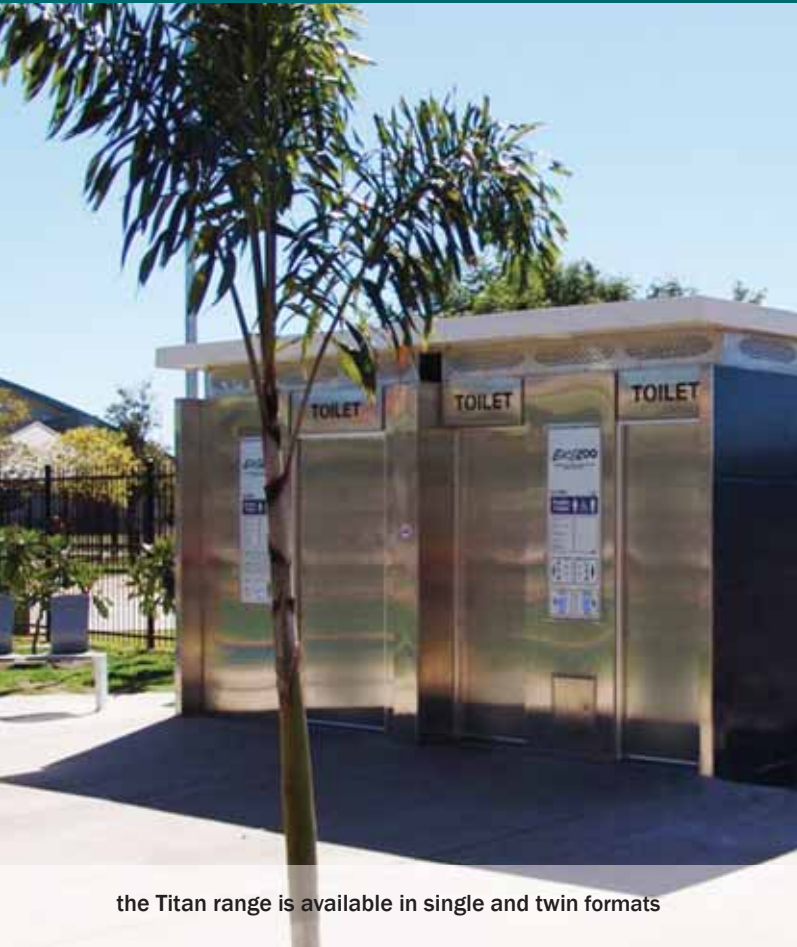
the Titan range is available in single and twin formats