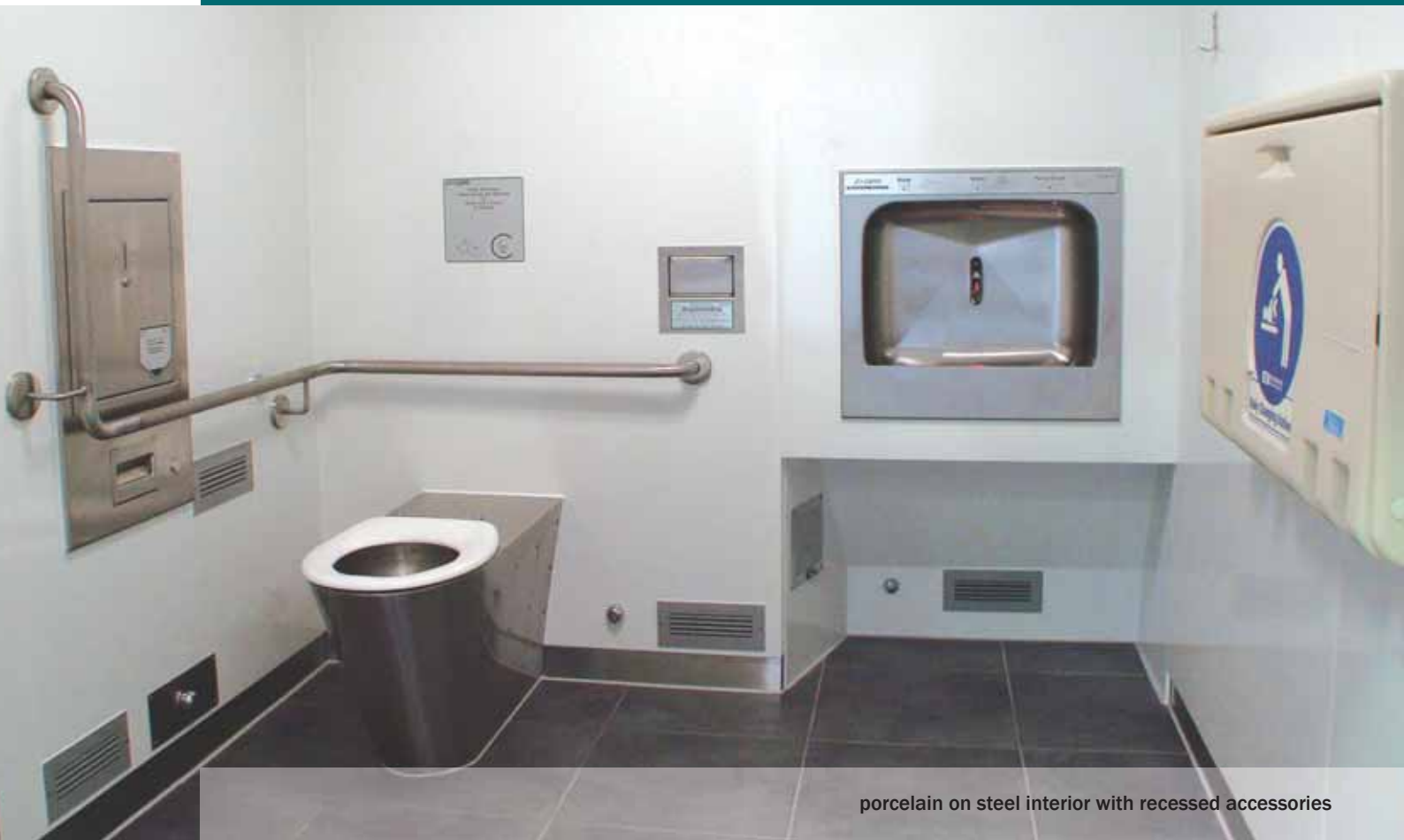
porcelain on steel interior with recessed accessories