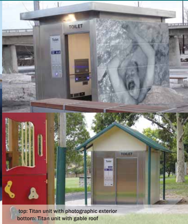
top: Titan unit with photographic exterior bottom: Titan unit with gable roof